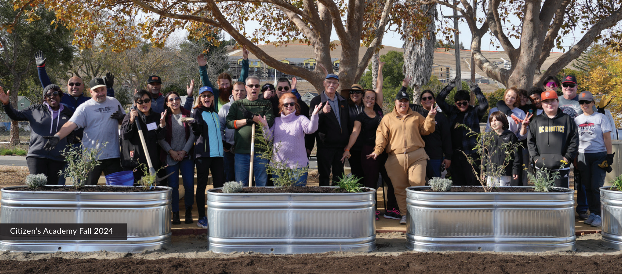
Citizen's Academy Fall 2024