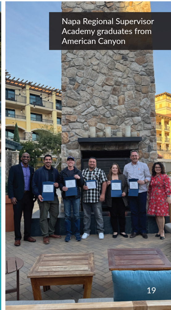
Napa Regional Supervisor Academy graduates from American Canyon

gave high marks for the organization demonstrating respect for employees of different cultures and belief systems, exceeding national benchmarks.