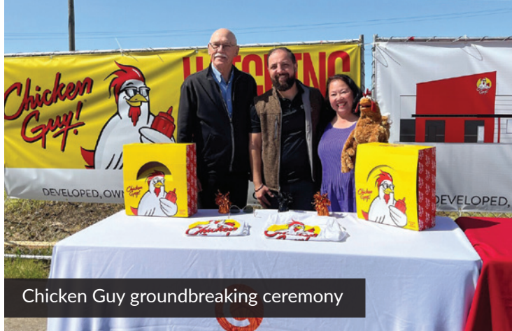
Chicken Guy groundbreaking ceremony