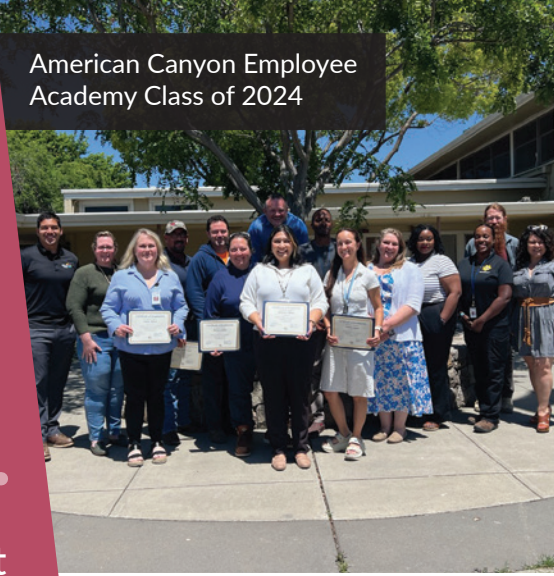
American Canyon Employee Academy Class of 2024