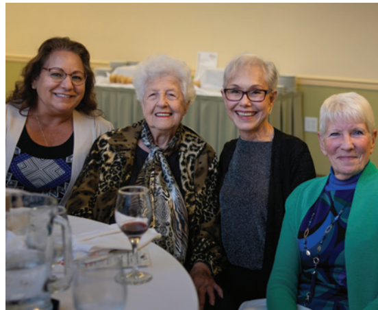
Photos from the 2024 Community Recognition Ball event.